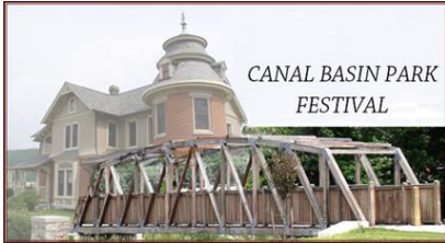
CANAL BASIN PARK FESTIVAL

The 4th Annual Canal Basin Park Festival and Outdoor Movie Night will take place on Saturday, August 12th. The festival will run from 4 pm -8 pm, followed by a free outdoor movie. Entertainment by various local groups will be provided throughout the day. The Silencers will perform on stage from 6 pm -8 pm. For more information or to become a vendor, please visit the HCP's website at www.hollidaysburg.org/canal-basin-park-festival . The event is sponsored by BLAIR MILL OUTLET . Additional sponsors include Capitol Hotel, Osgood Properties , and CopyRite & Banner Zone . Other sponsorship opportunities are available.