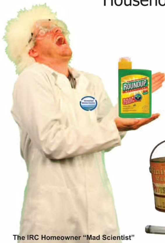
The IRC Homeowner "Mad Scientist"

Visit IRCenvironment.org or call 814-942-7472